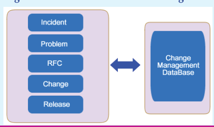
Diagram 1: Service Desk - Incident Management

Another facet of modernization was the implementation of a participant Service Desk. The purpose of the service desk will be to 'log' "service requests" or incidents, from ACH network participants by category, priority and urgency. This incident management system will provide TTIPS with the ability to monitor the efficiency of the provision of timely responses and resolution of incidents and queries affecting members. The service Desk differs from a call centre or help desk as it uses a broader, more user-centric approach, which will allow the integration of business processes into service management (Diagram 1).